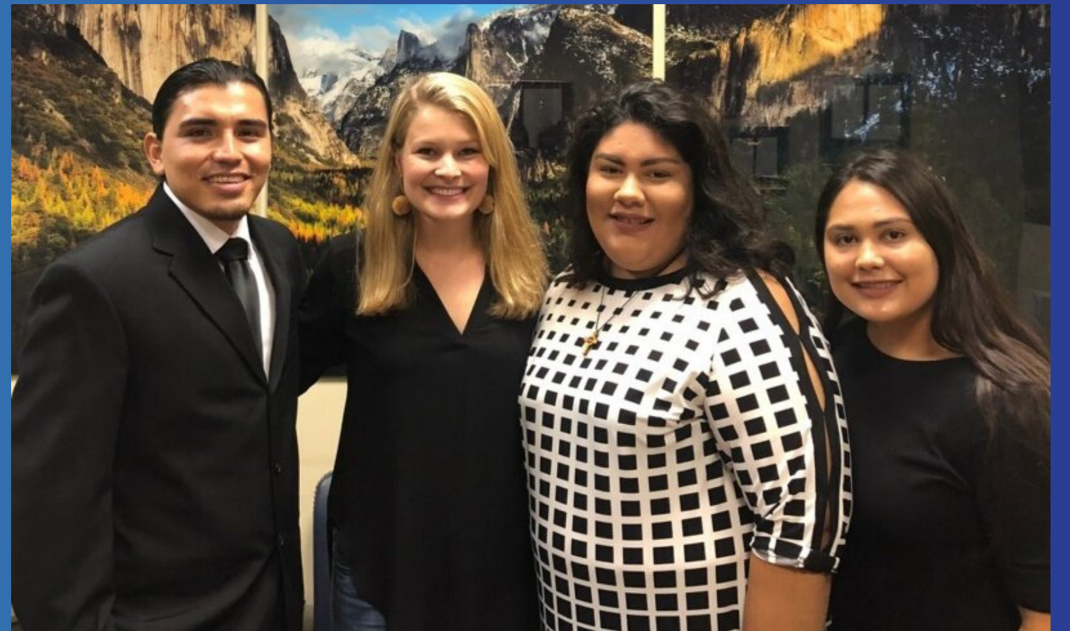
COLUMBAN ADVOCATES MEETING WITH SENATOR FEINSTEIN'S STAFF

-Congressional Management Foundation (2015)