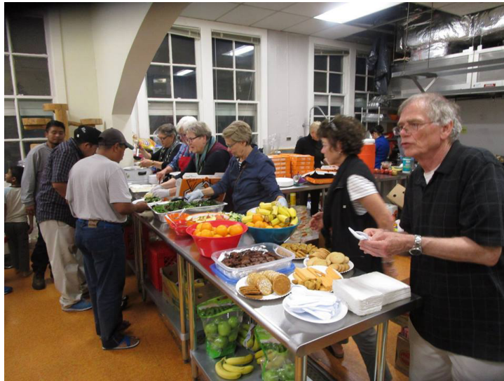
Border delegation serves supper to migrants at a local hospitality shelter

Why can't we tell what this experience will eventually mean for your own community? How could it mark the personal lives and histories of participants like yourself? Come on down, and let's find out.