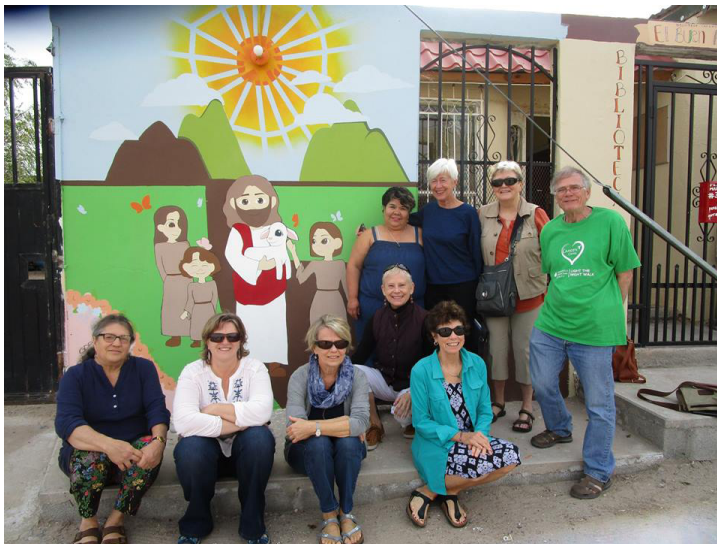
Border delegation visits the the scholarship and tutoring program El Buen Pastor

this kind of setting, and sometimes tell their stories of journeys lasting thousands of miles.